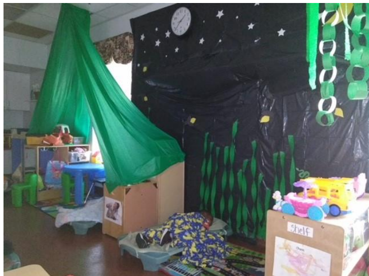
Centers include a campsite for dramatic play.